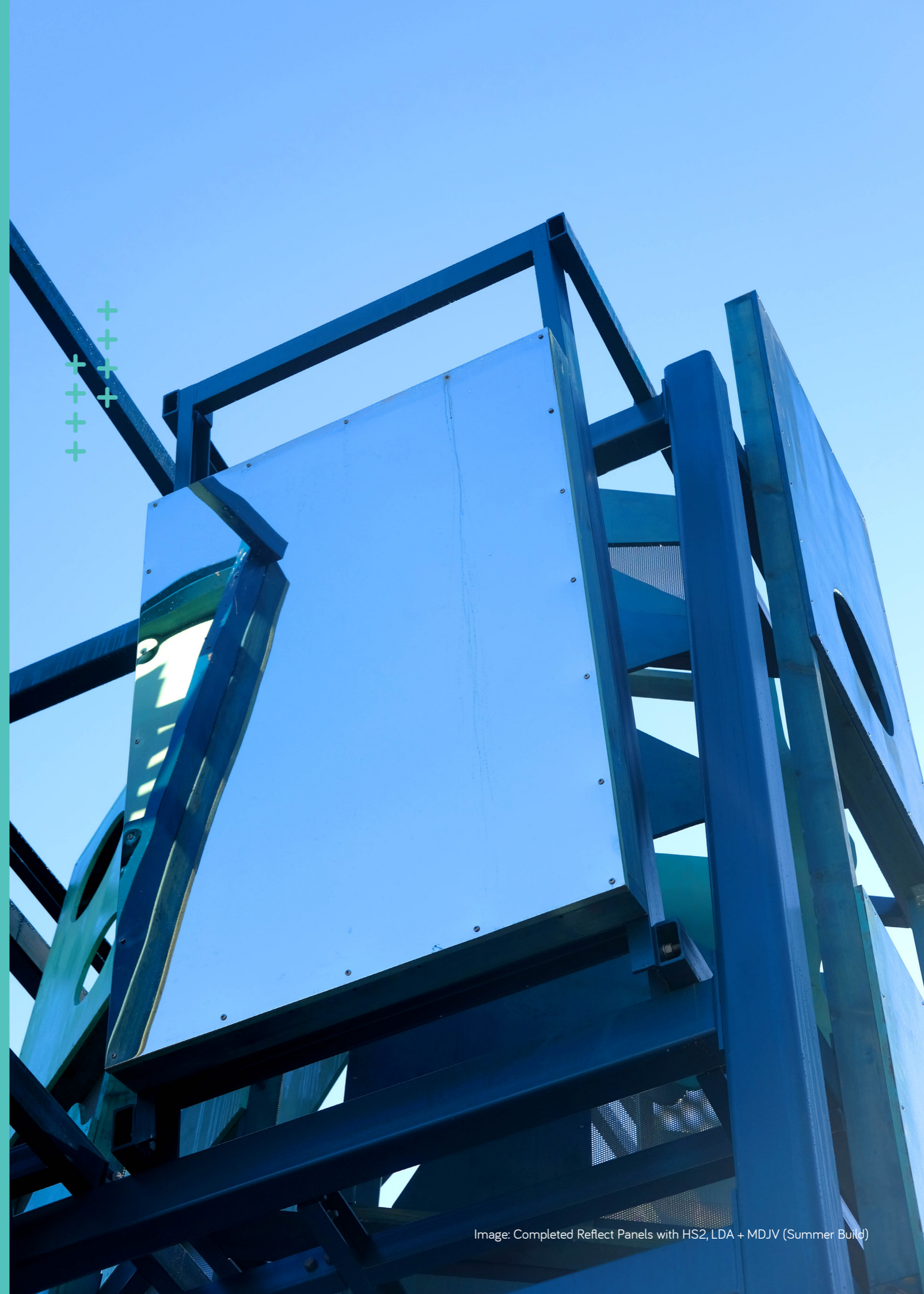
Image: Completed Reflect Panels with HS2, LDA + MDJV (Summer Build)