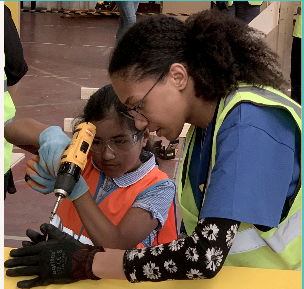
Image: Mega Maker Lab, Institute of Imagination, 2019, Fiona MacDonald

Why should young people directly shape their built environment?